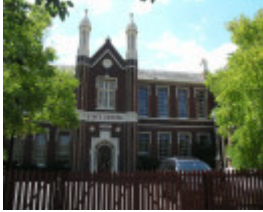
PRIMARY SCHOOL NO. 1253 SOHE 2008