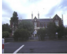
1 primary school number 1253 dorcas street south melbourne front view dec1984