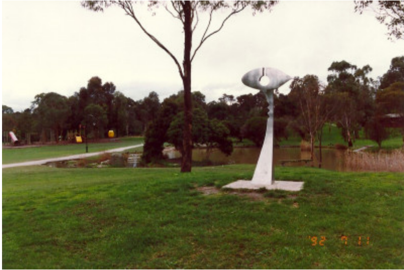
Alistair Knox Park Main Rd Eltham Colour 3 - Shire of Eltham Heritage Study 1992