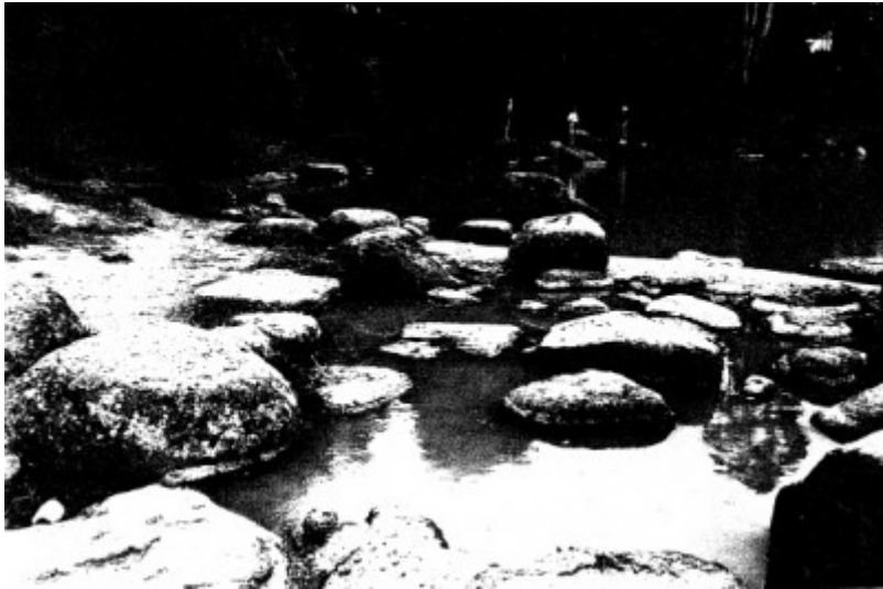
209 - Alistair Knox Park Main Rd Eltham 04 - Photograph shows rocks installed around lake edge important landscape feature - Shire of Eltham Heritage Study 1992