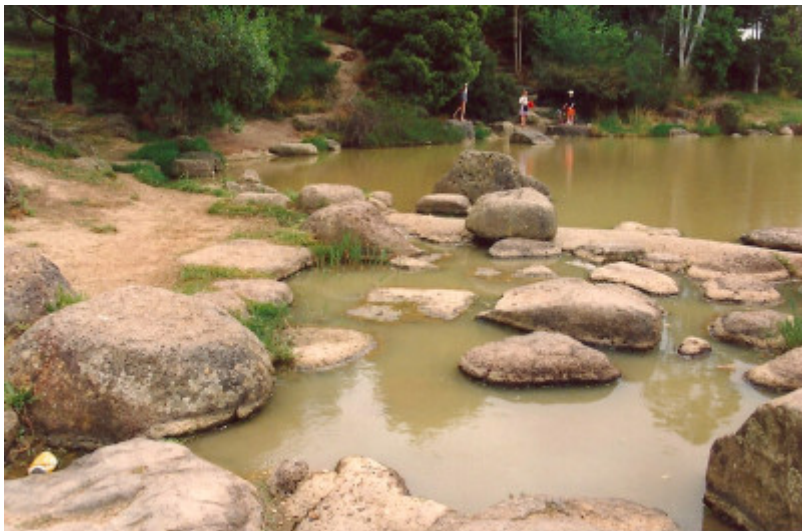
Alistair Knox Park Main Rd Eltham Colour 2 - Shire of Eltham Heritage Study 1992