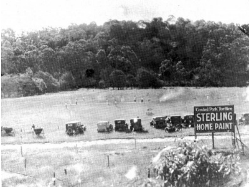
209 - Alistair Knox Park Main Rd Eltham 06 - Central Park in the 1920s or 1930s (ELHPC No. 684) - Shire of Eltham Heritage Study 1992