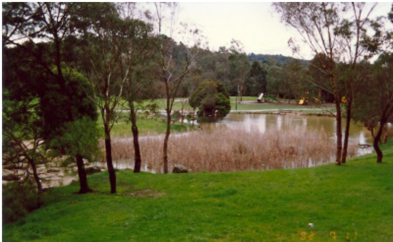
Alistair Knox Park Main Rd Eltham Colour 1 - Shire of Eltham Heritage Study 1992