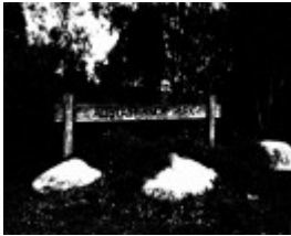
209 - Alistair Knox Park Main Rd Eltham - Photograph shows the prominently located park sign with low planting and rockwork in the foreground - Shire of Eltham Heritage Study 1992