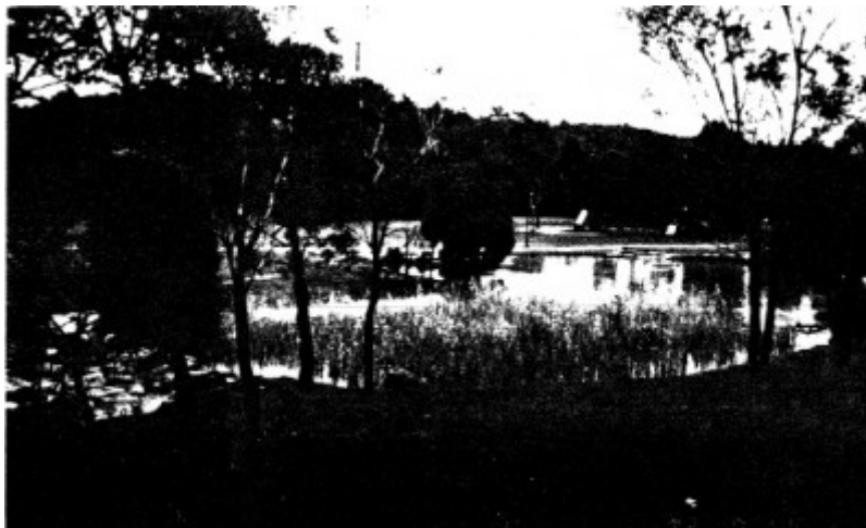
209 - Alistair Knox Park Main Rd Eltham 02 - Photograph illustrates natural form of lake and surrounding planting - - Shire of Eltham Heritage Study 1992