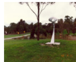
Alistair Knox Park Main Rd Eltham Colour 3 - Shire of Eltham Heritage Study 1992