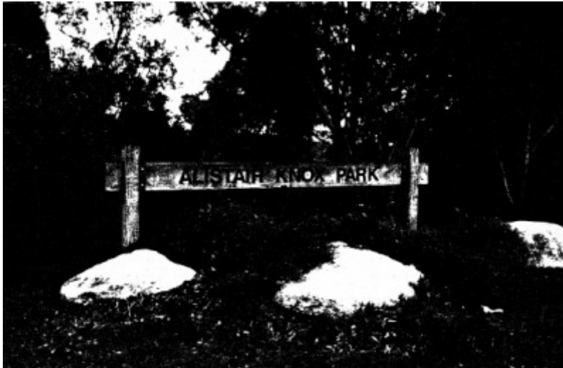
209 - Alistair Knox Park Main Rd Eltham - Photograph shows the prominently located park sign with low planting and rockwork in the foreground - Shire of Eltham Heritage Study 1992