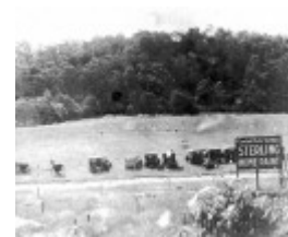
209 - Alistair Knox Park Main Rd Eltham 06 - Central Park in the 1920s or 1930s (ELHPC No. 684) - Shire of Eltham Heritage Study 1992