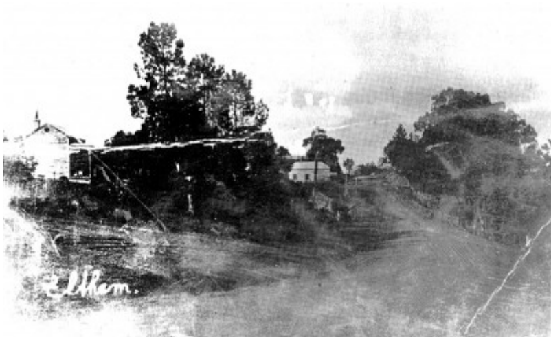
209 - Alistair Knox Park Main Rd Eltham 05 - Old photograph showing the Main Rd frontage (right hand side) of what is now the park (early 20th century?) (ELHPC No. 615) - Shire of Eltham Heritage Study 1992