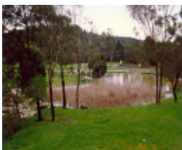
Alistair Knox Park Main Rd Eltham Colour 1 - Shire of Eltham Heritage Study 1992