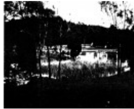
209 - Alistair Knox Park Main Rd Eltham 02 - Photograph illustrates natural form of lake and surrounding planting - - Shire of Eltham Heritage Study 1992