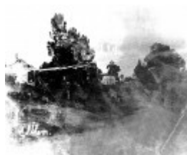
209 - Alistair Knox Park Main Rd Eltham 05 - Old photograph showing the Main Rd frontage (right hand side) of what is now the park (early 20th century?) (ELHPC No. 615) - Shire of Eltham Heritage Study 1992