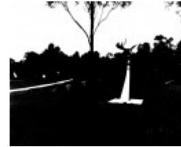
209 - Alistair Knox Park Main Rd Eltham 03 - Photograph illustrates natural form of lake and surrounding planting - - Shire of Eltham Heritage Study 1992