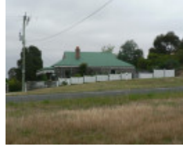
Athelston, 2025 Hamilton Highway, Murgheboluc viewed from north.