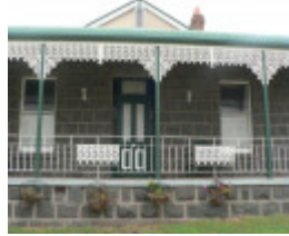
Athelston, 2025 Hamilton Highway, Murgheboluc viewed from east.