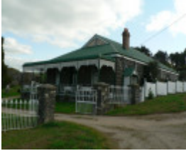
Athelston, 2025 Hamilton Highway, Murgheboluc viewed from north-east.