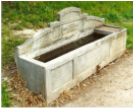
Horse Trough 1522 Main Rd Research Colour 1 - Shire of Eltham Heritage Study 1992