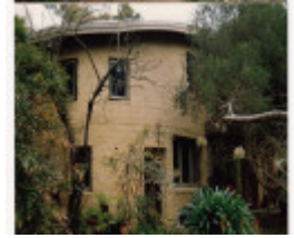
The Busst House Eltham Colour 1 - Shire of Eltham Heritage Study 1992