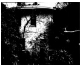
261 - The Busst House Eltham 08 - Shire of Eltham Heritage Study 1992