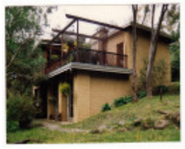
The Busst House Eltham Colour 4 - Shire of Eltham Heritage Study 1992