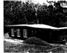
261 - The Busst House Eltham 04 - South elevation photographed during construction - Note the curved eastern end and roof following the descent of the stair within - Shire of Eltham Heritage Study 1992