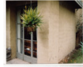
The Busst House Eltham Colour 3 - Shire of Eltham Heritage Study 1992