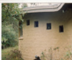
The Busst House Eltham Colour 5 - Shire of Eltham Heritage Study 1992