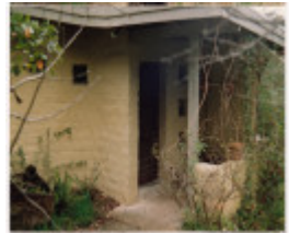
The Busst House Eltham Colour 2 - Shire of Eltham Heritage Study 1992