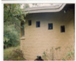
The Busst House Eltham Colour 5 - Shire of Eltham Heritage Study 1992