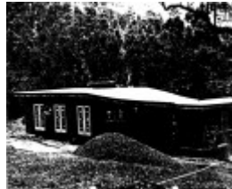
261 - The Busst House Eltham 04 - South elevation photographed during construction - Note the curved eastern end and roof following the descent of the stair within - Shire of Eltham Heritage Study 1992