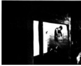
261 - The Busst House Eltham 12 - Shire of Eltham Heritage Study 1992