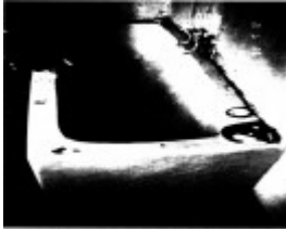
261 - The Busst House Eltham 14 - Shire of Eltham Heritage Study 1992