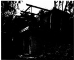
261 - The Busst House Eltham - Shire of Eltham Heritage Study 1992