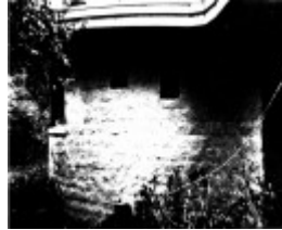
261 - The Busst House Eltham 07 - Shire of Eltham Heritage Study 1992