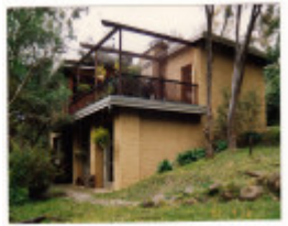
The Busst House Eltham Colour 4 - Shire of Eltham Heritage Study 1992