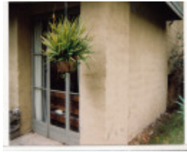
The Busst House Eltham Colour 3 - Shire of Eltham Heritage Study 1992