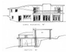
261 - The Busst House Eltham 06 - Drawing of the north elevation and section - Shire of Eltham Heritage Study 1992