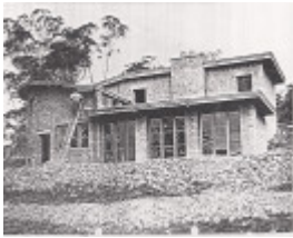
The Busst House Eltham Black & White 2 - Shire of Eltham Heritage Study 1992