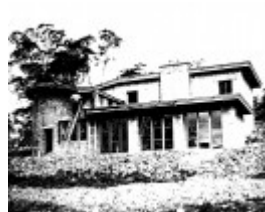
261 - The Busst House Eltham 02 - North elevation of the Busst House photographed during construction - Note the roof deck above the ground floor living room minus its balustrade which is still to be installed - Shire of Eltham Heritage Study 1992