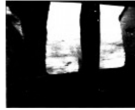
261 - The Busst House Eltham 13 - Shire of Eltham Heritage Study 1992