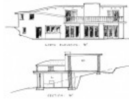
261 - The Busst House Eltham 06 - Drawing of the north elevation and section - Shire of Eltham Heritage Study 1992