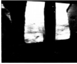
261 - The Busst House Eltham 13 - Shire of Eltham Heritage Study 1992