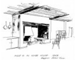
261 - The Busst House Eltham 05 - Sketch of the ground floor in-gate-nook - Shire of Eltham Heritage Study 1992