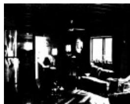
261 - The Busst House Eltham 09 - Shire of Eltham Heritage Study 1992