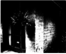
261 - The Busst House Eltham 11 -Shire of Eltham Heritage Study 1992