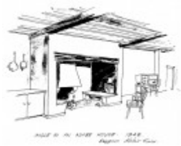
261 - The Busst House Eltham 05 - Sketch of the ground floor angle-nook - Shire of Eltham Heritage Study 1992