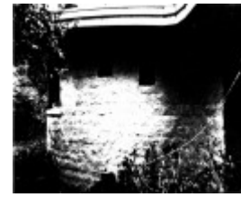
261 - The Busst House Eltham 07 - Shire of Eltham Heritage Study 1992