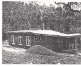
The Busst House Eltham Black & White 1 - Shire of Eltham Heritage Study 1992