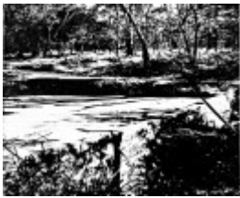
264 - State Battery Remans Smiths Gully - Shire of Eltham Heritage Study 1992