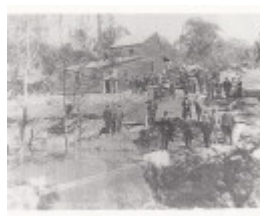
State Battery Remans Smiths Gully Black & White - Shire of Eltham Heritage Study 1992