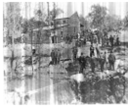
264 - State Battery Remans Smiths Gully 02 - Opening of the Queenstown circa 1910; it was burnt down in the 1962 bushfires and the dam and some machinery bases are all that survive - the photograph on the first page of this evaluation shows the same view