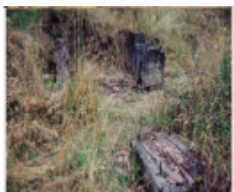
State Battery Remans Smiths Gully Colour 3 - Shire of Eltham Heritage Study 1992