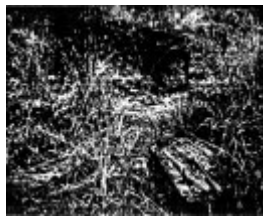
264 - State Battery Remans Smiths Gully 05 - Shire of Eltham Heritage Study 1992