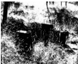
264 - State Battery Remans Smiths Gully 04 - Shire of Eltham Heritage Study 1992