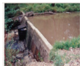
State Battery Remans Smiths Gully Colour 1 - Shire of Eltham Heritage Study 1992