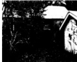
268 - Sweeneys Cottage Eltham 06 - Shire of Eltham Heritage Study 1992