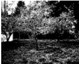
268 - Sweeneys Cottage Eltham 15 - Apple Orchard Trees - Shire of Eltham Heritage Study 1992