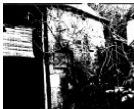
268 - Sweeneys Cottage Eltham 08 - Shire of Eltham Heritage Study 1992