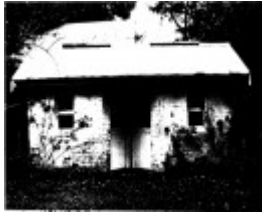
268 - Sweeneys Cottage Eltham 12 - Shire of Eltham Heritage Study 1992