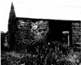
268 - Sweeneys Cottage Eltham 04 - 1949? photograph of the barn - Shire of Eltham Heritage Study 1992