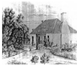
268 - Sweeneys Cottage Eltham 03 - Drawing of Sweeney's Cottage - Origins unknown - Shire of Eltham Heritage Study 1992