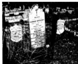
268 - Sweeneys Cottage Eltham 09 - Shire of Eltham Heritage Study 1992