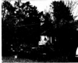
268 - Sweeneys Cottage Eltham 11 - Shire of Eltham Heritage Study 1992