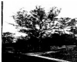
268 - Sweeneys Cottage Eltham 17 - 100 year old apple tree - Shire of Eltham Heritage Study 1992