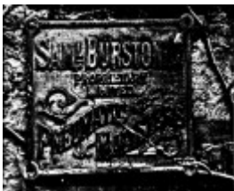
268 - Sweeneys Cottage Eltham 19 - Shire of Eltham Heritage Study 1992