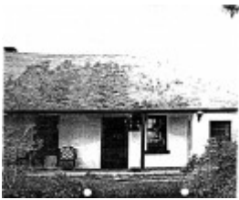
268 - Sweeneys Cottage Eltham - Shire of Eltham Heritage Study 1992