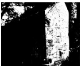
268 - Sweeneys Cottage Eltham 07 - Shire of Eltham Heritage Study 1992