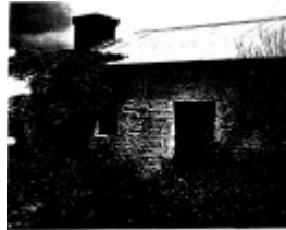
268 - Sweeneys Cottage Eltham 05 - 1949? photograph of a stone cottage stated to have been part of Sweeney's homestead - Shire of Eltham Heritage Study 1992