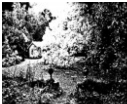
268 - Sweeneys Cottage Eltham 18 - Shire of Eltham Heritage Study 1992