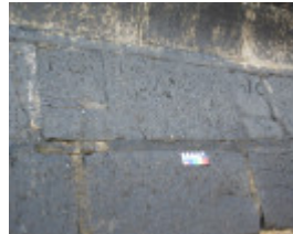
PROV2206 Grave markers 30 Jan 2009