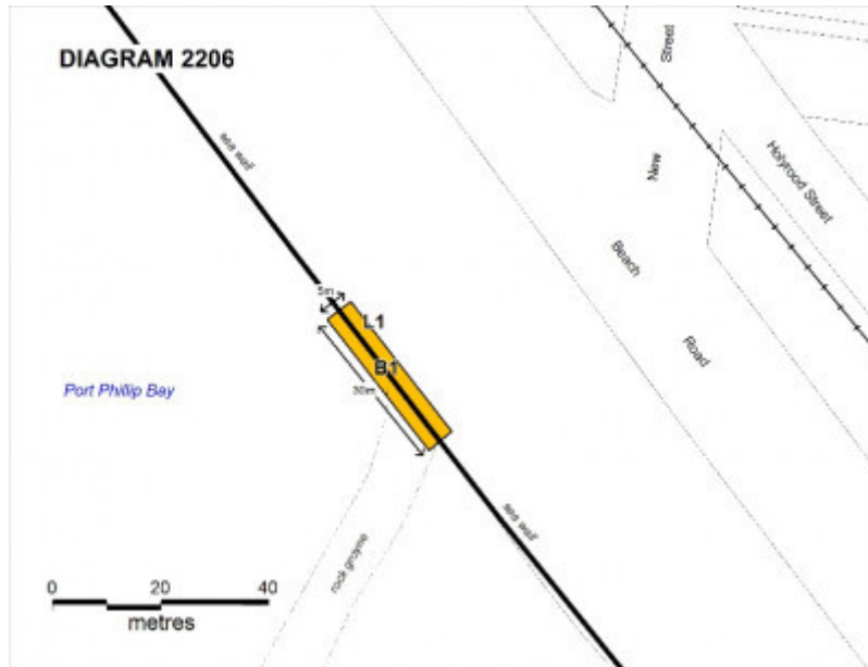
PROV H2206 old melb gaol burial markers