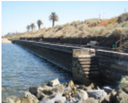
Burial Markers. Image taken 30 Jan 2009.JPG