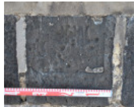
Burial Marker. Unknown. Image taken 17 Jan 2012..JPG