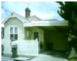
3 Lupton Street, Geelong West