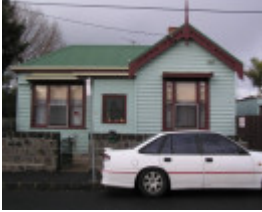
17 Clarence Street, Geelong West