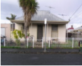
19 Clarence Street, Geelong West