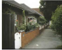
1 108 116 Gladstone Street South Melbourne Streetscape