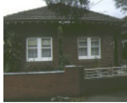
108 116 gladstone street south melbourne front view