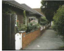
1 108 116 gladstone street south melbourne streetscape