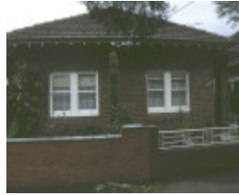
108 116 gladstone street south melbourne front view