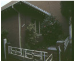
108 116 gladstone street south melbourne iron fence