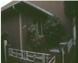
108 116 gladstone street south melbourne iron fence