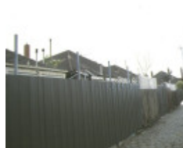
108 116 gladstone street south melbourne rear lane view