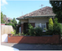
RESIDENCE SOHE 2008