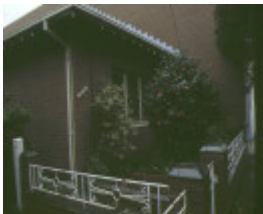
108 116 gladstone street south melbourne iron fence