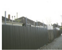
108 116 gladstone street south melbourne rear lane view