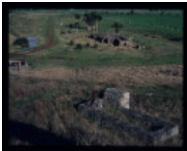
WONTHAGGI EASTERN AREA (NOS. 1 & 3 TUNNELS)