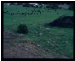
WONTHAGGI EASTERN AREA (NOS. 1 & 3 TUNNELS)