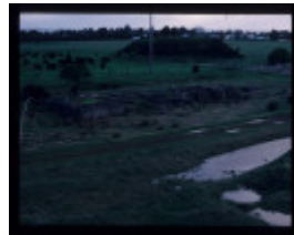
WONTHAGGI EASTERN AREA (NOS. 1 & 3 TUNNELS)