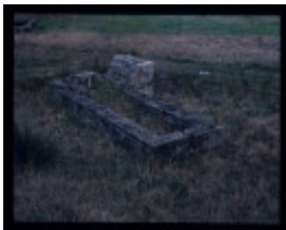
WONTHAGGI EASTERN AREA (NOS. 1 & 3 TUNNELS)