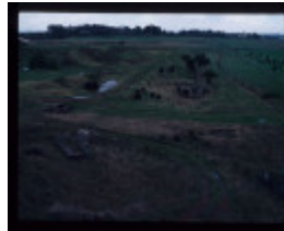
WONTHAGGI EASTERN AREA (NOS. 1 & 3 TUNNELS)