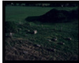
WONTHAGGI EASTERN AREA (NOS. 1 & 3 TUNNELS)