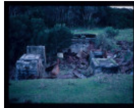
WONTHAGGI - WESTERN AREA