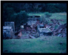
WONTHAGGI - WESTERN AREA