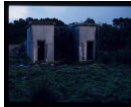
WONTHAGGI - WESTERN AREA