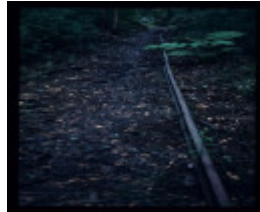
ADA NO.2 MILL