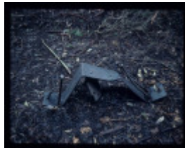
ADA NO.2 MILL