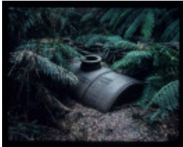
ADA NO.2 MILL