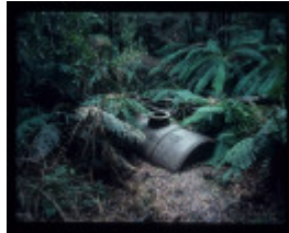
ADA NO.2 MILL