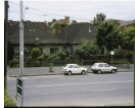
1 83 89 montague street south melbourne front view of row