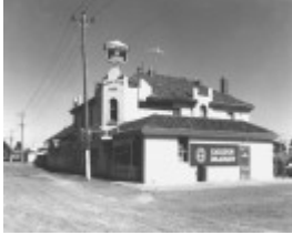
1759 - Brimbank City Council Post-contact Cultural Heritage Study 1999