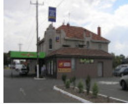
HO81 Guiding Star Hotel 1.JPG