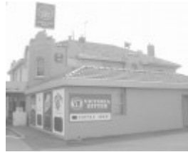
Site 075 - Guiding Star Hotel.jpg