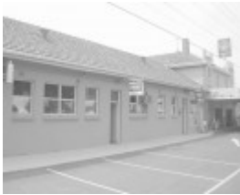
Site 075 - Guiding Star Hotel (2).jpg