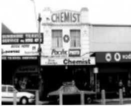
1789 - Brimbank City Council Post-contact Cultural Heritage Study 1999