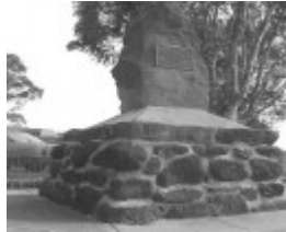
Site 010 - Hume & Hovell Cairn.jpg