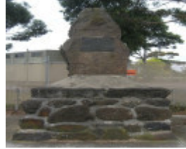
HO34 Hume Hovell Cairn.JPG