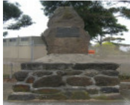
HO34 Hume Hovell Cairn.JPG