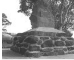
Site 010 - Hume & Hovell Cairn.jpg