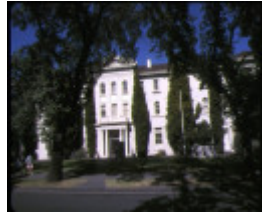
1 former victorian police mounted branch depot st kilda road southbank front entrance