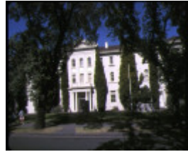
1 former Victorian police mounted branch depot St Kilda Road Southbank front entrance