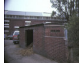
Former Victorian Police Mounted Branch Depot St Kilda Road Southbank Rear View March 1985