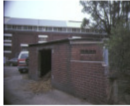
Former Victorian Police Mounted Branch Depot St Kilda Road Southbank Rear View March 1985