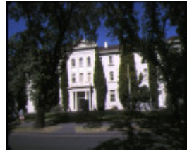
1 former Victorian police mounted branch depot St Kilda Road Southbank front entrance