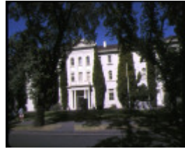
1 former Victorian police mounted branch depot St Kilda Road Southbank front entrance