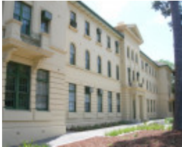
FORMER VICTORIA POLICE DEPOT SOHE 2008