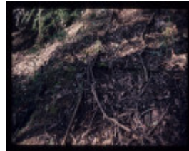
BARNEWALL & LEE'S LOWERING GEAR