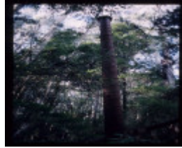
BARNEWALL & LEE'S LOWERING GEAR