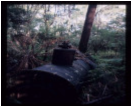
BARNEWALL & LEE'S LOWERING GEAR