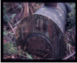
BARNEWALL & LEE'S LOWERING GEAR