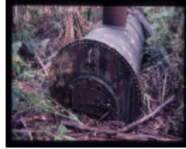
BARNEWALL & LEE'S LOWERING GEAR