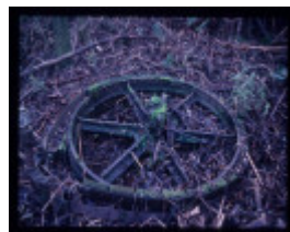
BARNEWALL & LEE'S LOWERING GEAR