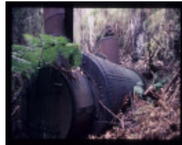
BARNEWALL & LEE'S LOWERING GEAR