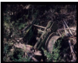
BARNEWALL & LEE'S LOWERING GEAR