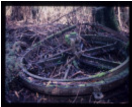
BARNEWALL & LEE'S LOWERING GEAR