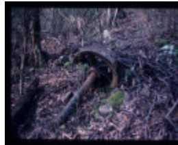
BARNEWALL & LEE'S LOWERING GEAR