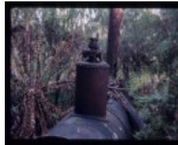
BARNEWALL & LEE'S LOWERING GEAR