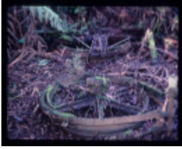
BARNEWALL & LEE'S LOWERING GEAR