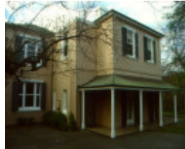
1 h206 richmond house june 2001