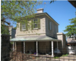
RICHMOND HOUSE SOHE 2008