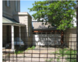
RICHMOND HOUSE SOHE 2008