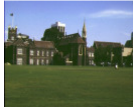
h00019 melbourne grammar school st kilda road side external