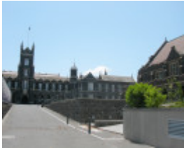
MELBOURNE GRAMMAR SCHOOL SOHE 2008