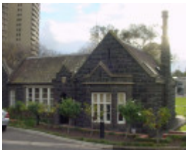
h00019 melbourne grammar school st kilda road melbourne lodge south elevation she project 2004