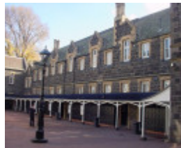
h00019 melbourne grammar school st kilda road melbourne quadrangle north south she project 2004