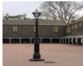
h00019 melbourne grammar school st kilda road melbourne quad lamp she project 2004