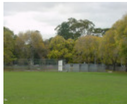
h00019 melbourne grammar school st kilda road melbourne domain road east trees she project 2004