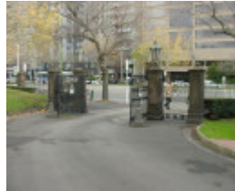
h00019 melbourne grammar school st kilda road melbourne barrett gates she project 2004