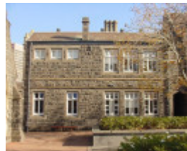
h00019 melbourne grammar school st kilda road melbourne cumming wing east she project 2004