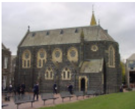
h00019 melbourne grammar school st kilda road melbourne chapel south she project 2004