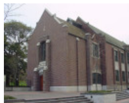
h00019 melbourne grammar school st kilda road melbourne wadhurst hall she project 2004