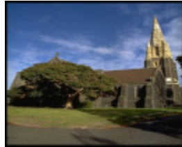
h00635 christ church toorak