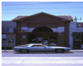
1 former south yarra railway station toorak road south yarra front view