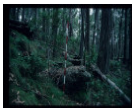
STAKER'S TRACK STABLES