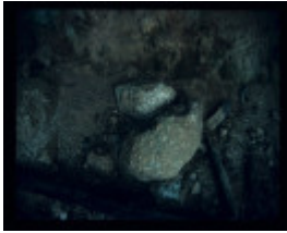
STAKER'S TRACK STABLES