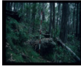
STAKER'S TRACK STABLES