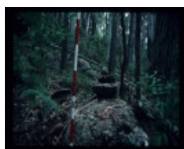
STAKER'S TRACK STABLES