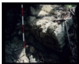
STAKER'S TRACK STABLES