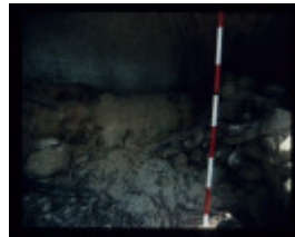
STAKER'S TRACK STABLES