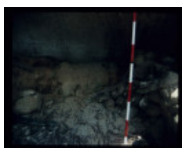
STAKER'S TRACK STABLES