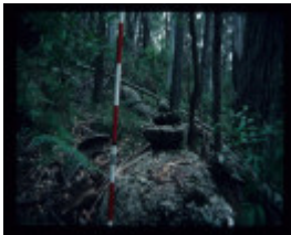
STAKER'S TRACK STABLES