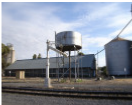
ST ARNAUD RAILWAY STATION SOHE 2008