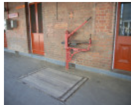
ST ARNAUD RAILWAY STATION SOHE 2008