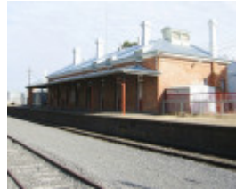
ST ARNAUD RAILWAY STATION SOHE 2008