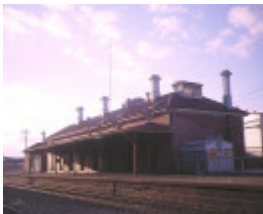
1 st arnaud railway station avenue st arnaud trackside view may1995