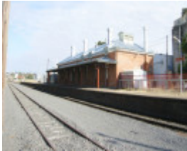
ST ARNAUD RAILWAY STATION SOHE 2008