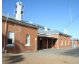
ST ARNAUD RAILWAY STATION SOHE 2008