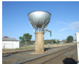
ST ARNAUD RAILWAY STATION SOHE 2008