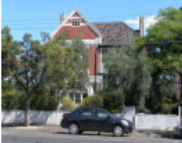
FORMER PRIORY LADIES SCHOOL SOHE 2008