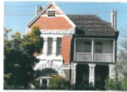
FORMER PRIORY LADIES SCHOOL SOHE 2008 H0726 H0726 frontview