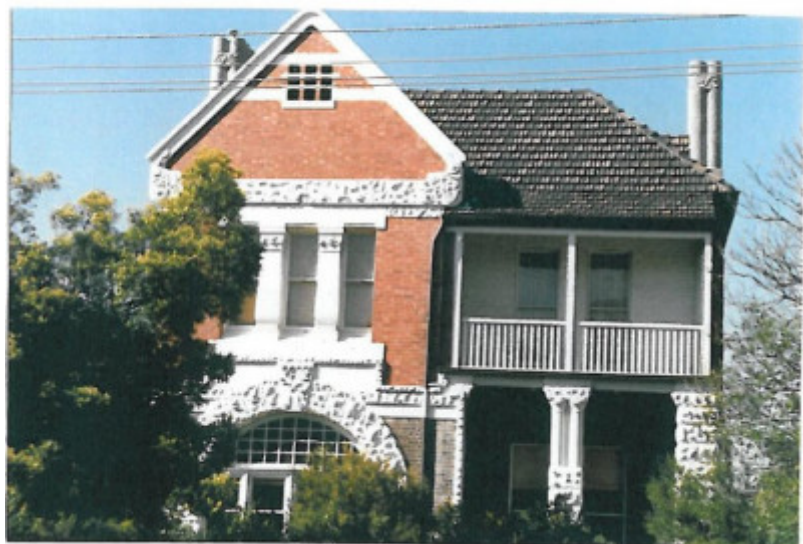
H0726 H0726 frontview