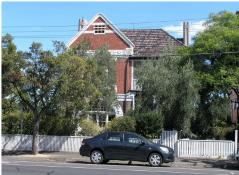
FORMER PRIORY LADIES SCHOOL SOHE 2008