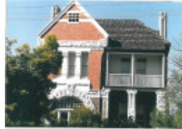
FORMER PRIORY LADIES SCHOOL SOHE 2008 H0726 H0726 frontview