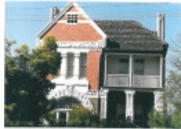
H0726 H0726 frontview