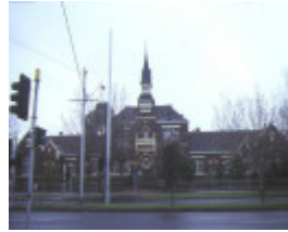
1 primary school no 1479 brighton road st kilda front view