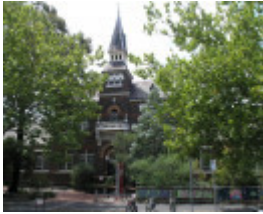
PRIMARY SCHOOL NO. 1479 SOHE 2008