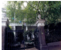
h00761 wilgah burnett st st kilda front gate she project 2003