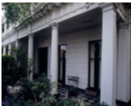
h00761 wilgah burnett st st kilda front verandah she project 2003