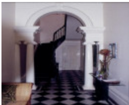
h00761 wilgah burnett st st kilda front entrance she project 2003