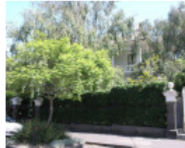
WILGAH SOHE 2008