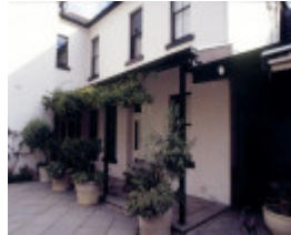
h00761 wilgah burnett st st kilda back verandah she project 2003