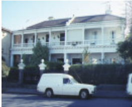
1 residence 6 and 8 burnett street st kilda front view jun1988