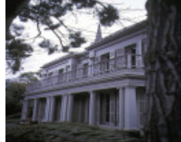
1 oberwyl burnett street st kilda view of balcony & amp; columns