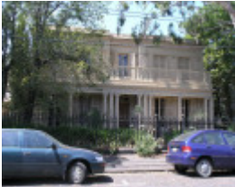
OBERWYL SOHE 2008