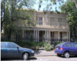
OBERWYL SOHE 2008