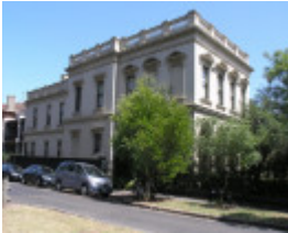
FLEURS SOHE 2008