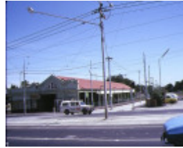
1 st kilda railway station front view feb1989