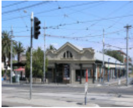
FORMER ST KILDA RAILWAY STATION COMPLEX SOHE 2008