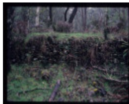
SLOAN'S SAWMILL, SNOWY CREEK