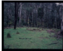
SLOAN'S SAWMILL, SNOWY CREEK