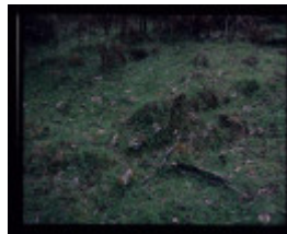
SLOAN'S SAWMILL, SNOWY CREEK