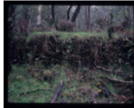
SLOAN'S SAWMILL, SNOWY CREEK