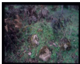
SLOAN'S SAWMILL, SNOWY CREEK