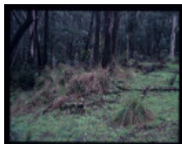
SLOAN'S SAWMILL, SNOWY CREEK