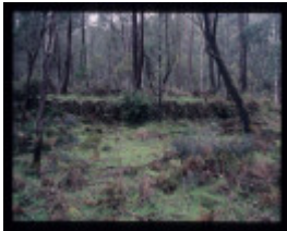
SLOAN'S SAWMILL, SNOWY CREEK