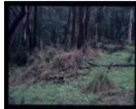
SLOAN'S SAWMILL, SNOWY CREEK