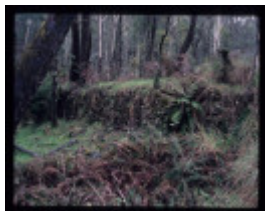
SLOAN'S SAWMILL, SNOWY CREEK