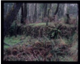
SLOAN'S SAWMILL, SNOWY CREEK