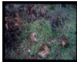
SLOAN'S SAWMILL, SNOWY CREEK