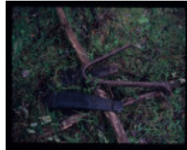
SLOAN'S SAWMILL, SNOWY CREEK