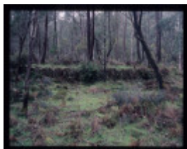
SLOAN'S SAWMILL, SNOWY CREEK