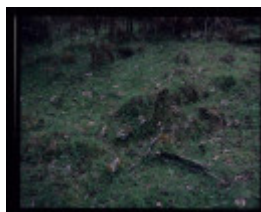
SLOAN'S SAWMILL, SNOWY CREEK