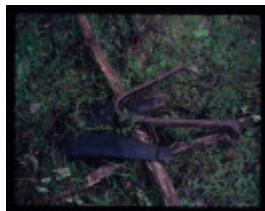
SLOAN'S SAWMILL, SNOWY CREEK