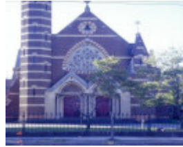
h00864 1 st georges uniting church chapel street st kilda front view she project 2003