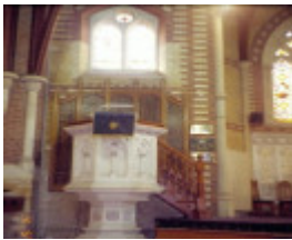
h00864 st george uniting church chapel st st kilda pulpit she project 2003