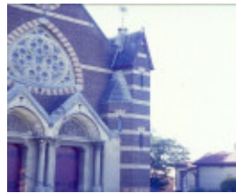
h00864 st georges uniting church chapel street st kilda south side turret she project 2003