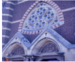
h00864 st georges uniting church chapel street st kilda detail external she project 2003