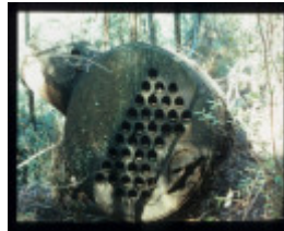
DEPTFORD PROPRIETARY MINE