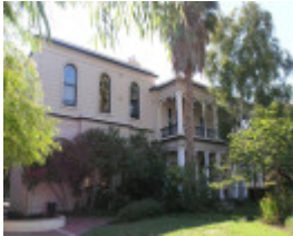
Rondebosch SOHE 2008