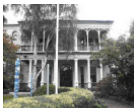
H0754 1 Rondebosch july 2004 she project