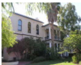
Rondebosch SOHE 2008