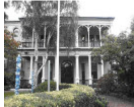
H0754 1 Rondebosch july 2004 she project