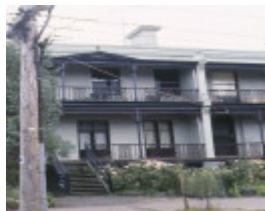
1 eden terrace dalgety street st kilda front view