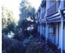
eden terrace dalgety street st kilda view front gardens she project 2003