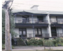
1 eden terrace dalgety street st kilda front view