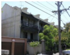
EDEN TERRACE SOHE 2008