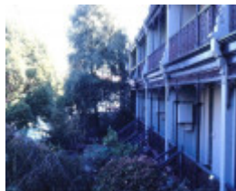
eden terrace dalgety street st kilda view front gardens she project 2003