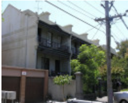
EDEN TERRACE SOHE 2008