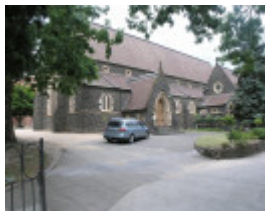
ST MARYS CHURCH SOHE 2008