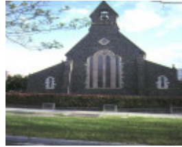
1 st mary's church dandenong road st kilda front view of church