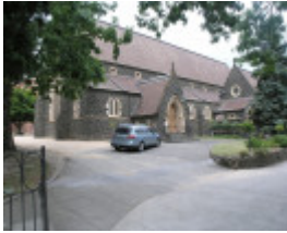
ST MARYS CHURCH SOHE 2008