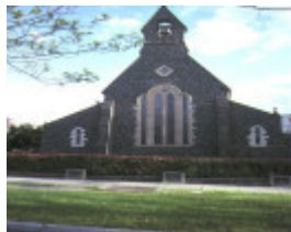
1 st mary's church dandenong road st kilda front view of church