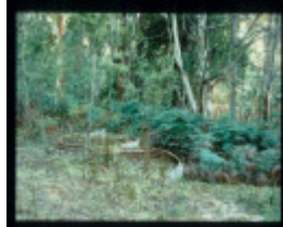
VICTORIA STAR QUARTZ MINE