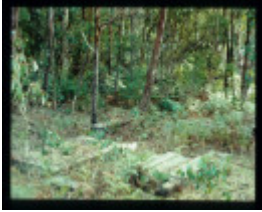
VICTORIA STAR QUARTZ MINE