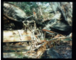
VICTORIA STAR QUARTZ MINE