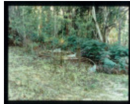
VICTORIA STAR QUARTZ MINE