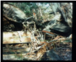
VICTORIA STAR QUARTZ MINE