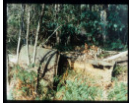
VICTORIA STAR QUARTZ MINE