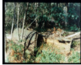
VICTORIA STAR QUARTZ MINE