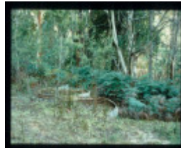
VICTORIA STAR QUARTZ MINE