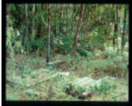
VICTORIA STAR QUARTZ MINE