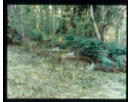
VICTORIA STAR QUARTZ MINE