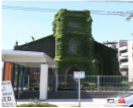
FORMER WESLEYAN METHODIST CHURCH SOHE 2008