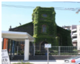
FORMER WESLEYAN METHODIST CHURCH SOHE 2008