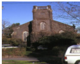
1 former wesleyan methodist church fitzroy street st kilda front view of church