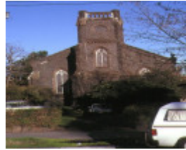
1 former wesleyan methodist church fitzroy street st kilda front view of church