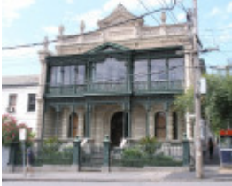
RIPPLEMERE SOHE 2008