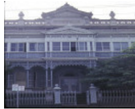
h00747 ripplemere grey street st kilda front view oct1980