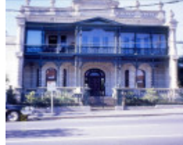
h00747 1 ripplemere grey street st kilda front view she project 2003