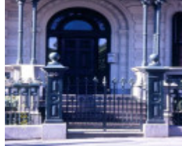
h00747 ripplemere grey street st kilda front entrance she project 2003