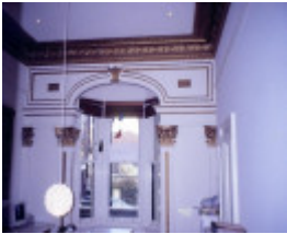
h00747 ripplemere grey street st kilda front room she project 2003