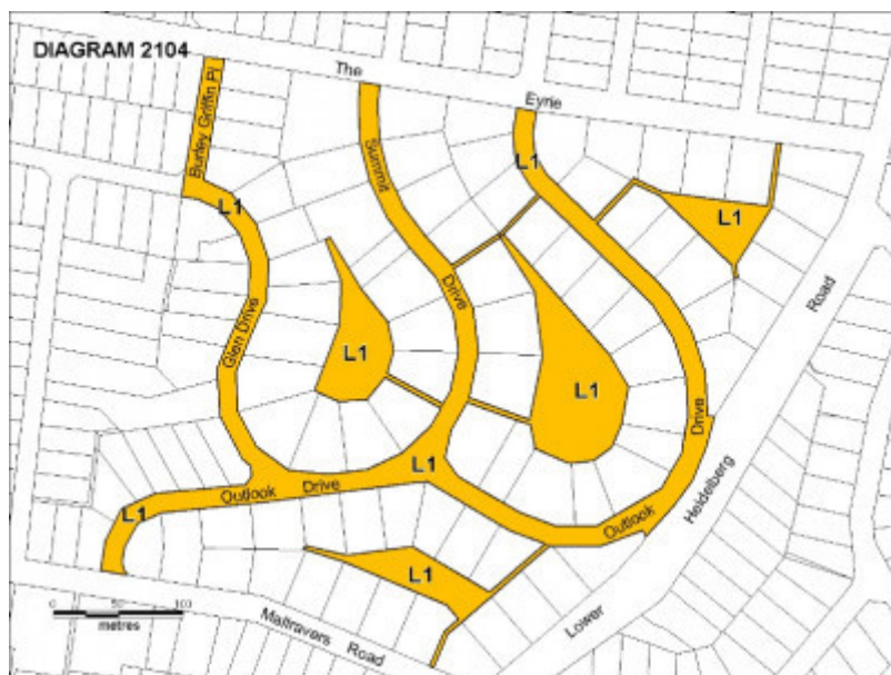
H2104 mount eagle plan