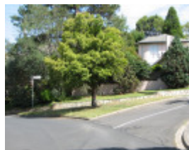
MOUNT EAGLE ESTATE SOHE 2008