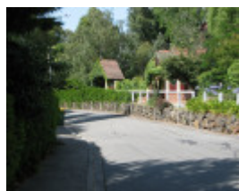
MOUNT EAGLE ESTATE SOHE 2008