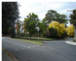
H2104 1 Mount Eagle Estate Cnr Outlook Glen Drives April 2006 mz 008