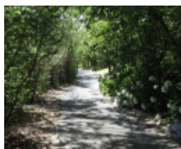
MOUNT EAGLE ESTATE SOHE 2008