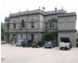
EILDON SOHE 2008