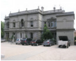
EILDON SOHE 2008