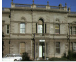
1 eildon grey street st kilda rear view