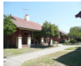
ALEXANDER MILLER MEMORIAL HOMES SOHE 2008