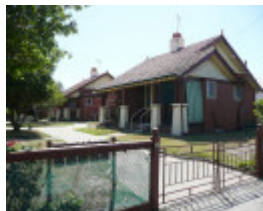
ALEXANDER MILLER MEMORIAL HOMES SOHE 2008