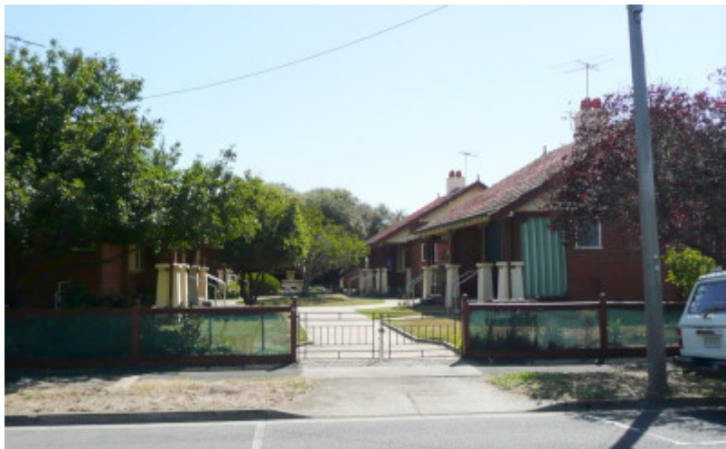
ALEXANDER MILLER MEMORIAL HOMES SOHE 2008