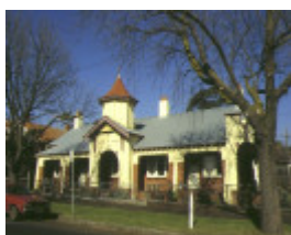
1 alexander miller memorial homes 73 mckillop street geelong front view