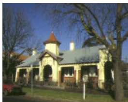
1 alexander miller memorial homes 73 mckillop street geelong front view