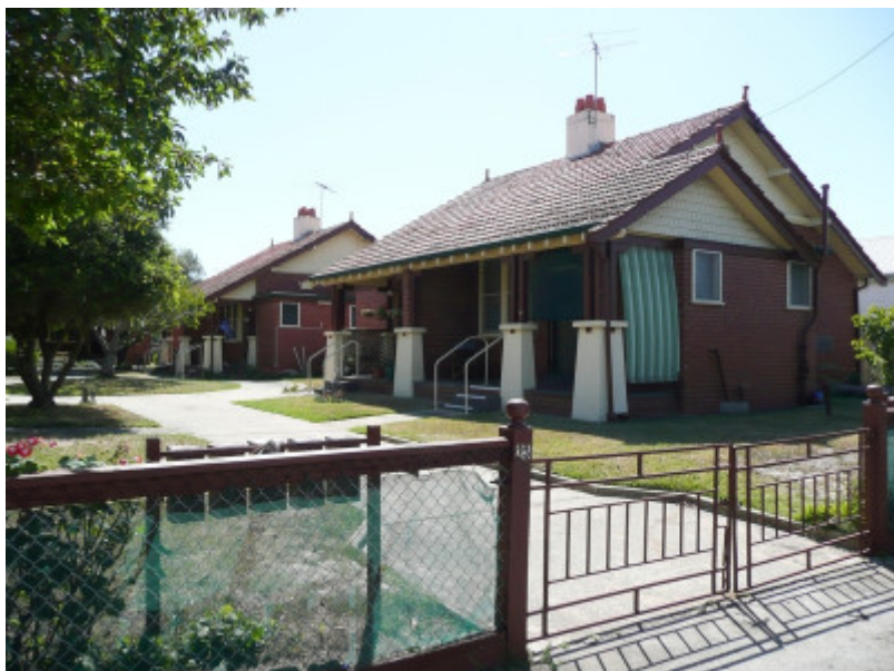
ALEXANDER MILLER MEMORIAL HOMES SOHE 2008