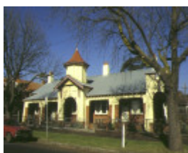
1 alexander miller memorial homes 73 mckillop street geelong front view