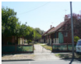
ALEXANDER MILLER MEMORIAL HOMES SOHE 2008