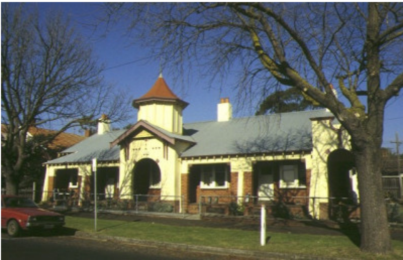
1 alexander miller memorial homes 73 mckillop street geelong front view