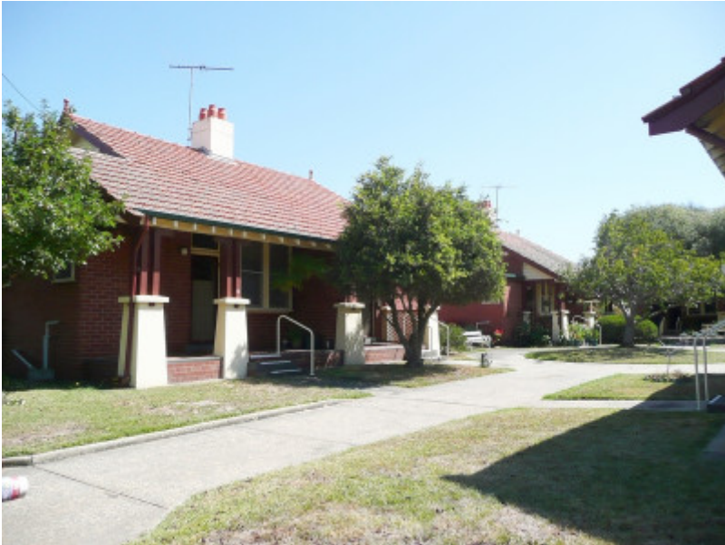
ALEXANDER MILLER MEMORIAL HOMES SOHE 2008