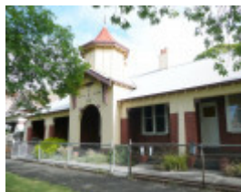
ALEXANDER MILLER MEMORIAL HOMES SOHE 2008