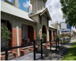
Alexander Miller Memorial Homes 2021