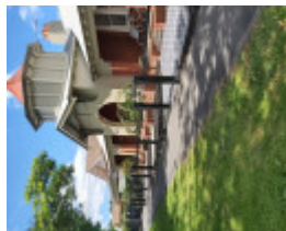
Alexander Miller Memorial Homes 2021