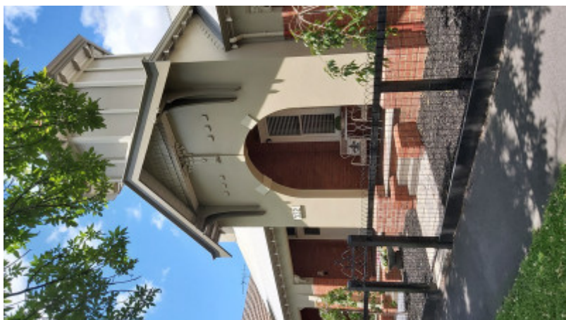
Alexander Miller Memorial Homes 2021