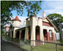
ALEXANDER MILLER MEMORIAL HOMES SOHE 2008