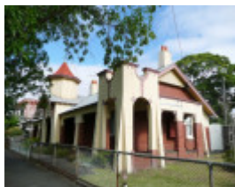
ALEXANDER MILLER MEMORIAL HOMES SOHE 2008