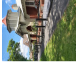
Alexander Miller Memorial Homes 2021