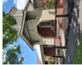
Alexander Miller Memorial Homes 2021