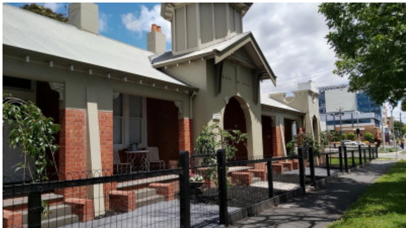
Alexander Miller Memorial Homes 2021