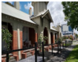
Alexander Miller Memorial Homes 2021