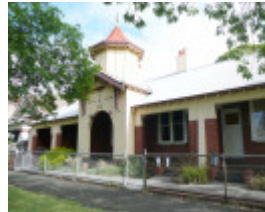
ALEXANDER MILLER MEMORIAL HOMES SOHE 2008