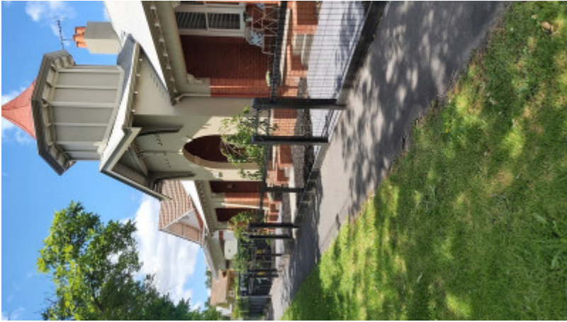
Alexander Miller Memorial Homes 2021