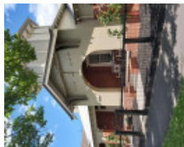
Alexander Miller Memorial Homes 2021