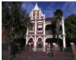
1 residences 77 79 grey street st kilda front view sep1989