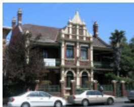
RESIDENCES SOHE 2008