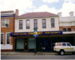
SD 159a - Former Alfred Giles Hardware Store, 70 Napier Street, ST ARNAUD