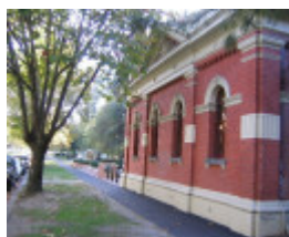
h00675 former gas valve house st kilda road st kilda along street she project 2004