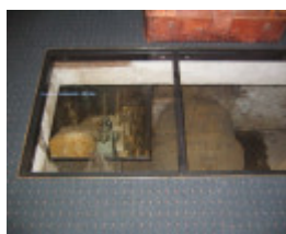
h00675 former gas valve house st kilda road st kilda gas valve she project 2004