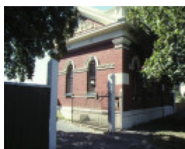
h00675 former gas valve house st kilda road st kilda front gates mar1979