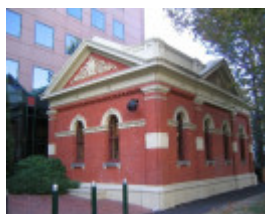
h00675 1 former gas valve house st kilda road st kilda street view she project 2004