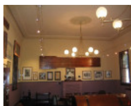
h00675 former gas valve house st kilda road st kilda inside ceiling she project 2004