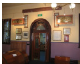
h00675 former gas valve house st kilda road st kilda entrance she project 2004