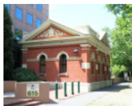
FORMER GAS VALVE HOUSE SOHE 2008